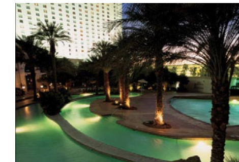
3770 Las Vegas Blvd South - Las Vegas, Nevada Located on the strip, across the street from MGM Grand. Free Parking. www.monte-carlo.com

PESI HealthCare has secured a very limited block of rooms on a first-come, first-served basis for $54.00 per night for the nights of Sunday 10/23, Monday 10/24, Tuesday 10/25 & Wednesday 10/26/11. Rates are for a Single or Double room and are subject to a 72-hour cancellation fee.